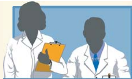
Each practice should designate a Primary Vaccine Coordinator and a Backup Vaccine Coordinator.

Each office should also designate a backup vaccine coordinator who is able to perform the same tasks as the primary vaccine coordinator in the event that the primary person is unavailable. Both the primary and backup vaccine coordinators should be fully trained in routine and emergency procedures related to vaccine shipments, storage, handling, transport, and inventory management.